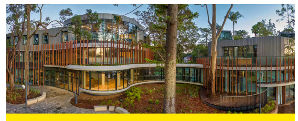
SENIOR SCHOOL SCIENCE AND ART BUILDINGS (COMPLETED IN LATE 2022)

With your help, the next phase of building will become a reality.