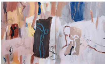
Hot Burn , 2021, oil on canvas, 122 X 200 cm (diptych) (not included in the exhibition)