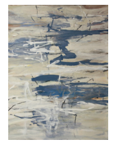
Ruo Shui , 2022, oil on canvas, 183 x 138 cm