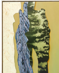
Lacuna , 2018 oil on linen 53 x 43 cm