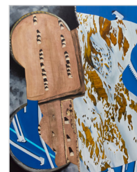
Certain Passages , 2020 oil on linen 140 x 110 cm (framed)

Gallery hours Tuesday to Saturday 10 am-5 pm | FREE ENTRY | Gate 7, 1666 Pacific Highway, Wahroonga | 02 9473 7878 gcsgallery@abbotsleigh.nsw.edu.au | www.gcsgallery.com.au | An Anglican Pre K-12 Day and Boarding School for girls