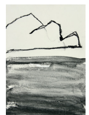
Study for Bald Head 2 , 2022, pastel on paper, 42 x 30 cm