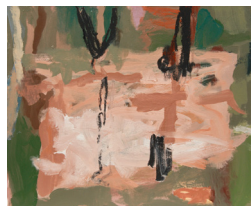
Longswamp 3 , 2022, oil on canvas, 41 x 51 cm