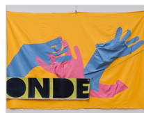
Todos juntos (All together) , 2020 cotton, thread 138 x 215 cm