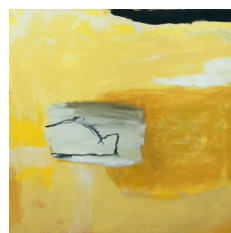
Bald Head , 2022, oil on canvas, 102 x 102 cm