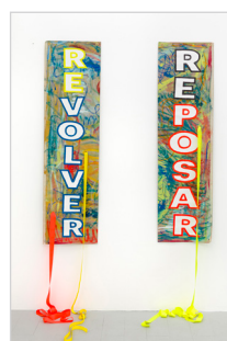
Revolver (Stir) [Reposar (Rest)] , 2021 oil, flashe, acrylic, cotton and ribbon on linen 120 x 40 cm (two parts)