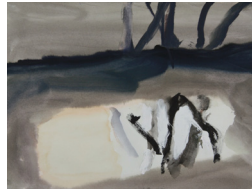
Platypus Pool 3 , 2022, gouache on paper, 28 x 38 cm