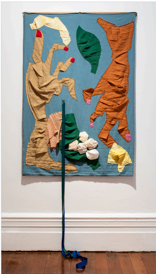
Dulce de lechoza verde (procedimiento) [Green papaya sweet (procedure)], 2021, cotton, linen, and corduroy on linen textile, 145 x 100 cm