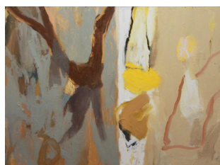
Cowan , 2020-23, oil on canvas, 102 x 137 cm