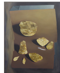
Precious Objects , 2019 oil on linen 81 x 66 cm