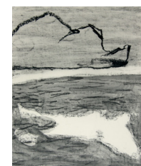
Study for Bald Head 1 , 2022, pastel on paper, 46 x 38 cm