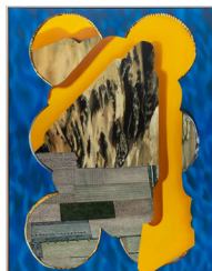
Space Without Sequence , 2020 oil on linen 140 x 110 cm (framed)