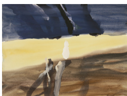
Platypus Pool 1 , 2022, gouache on paper, 28 x 38 cm