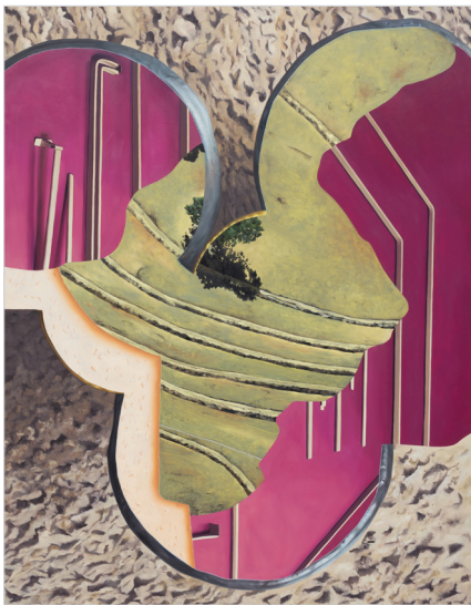
Turning in Circles , 2020 oil on linen 140 x 110 cm (framed)