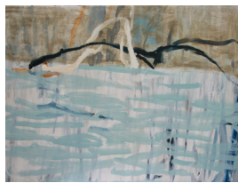
Water-borne , 2022, oil on canvas, 138 x 183 cm