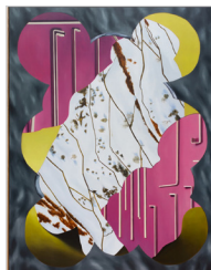
Arbitrary Path , 2020 oil on linen 140 x 110 cm (framed)