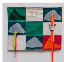
Con toda su energía (With all its energy) , 2020 felt, acrylic, cotton, recycled fabrics, archival material, ribbon 115 x 145 cm