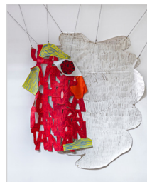
Nubesota (Big cloud) , 2020 oil stick on linen 238 x 165 cm