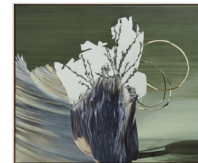
Water Spirals , 2016 oil on linen 73 x 88 cm