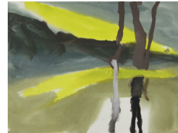
Platypus Pool 4 , 2022, gouache on paper, 28 x 38 cm