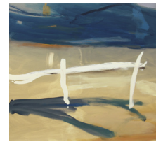
Dry Dock , 2022, oil on canvas, 112 x 122 cm