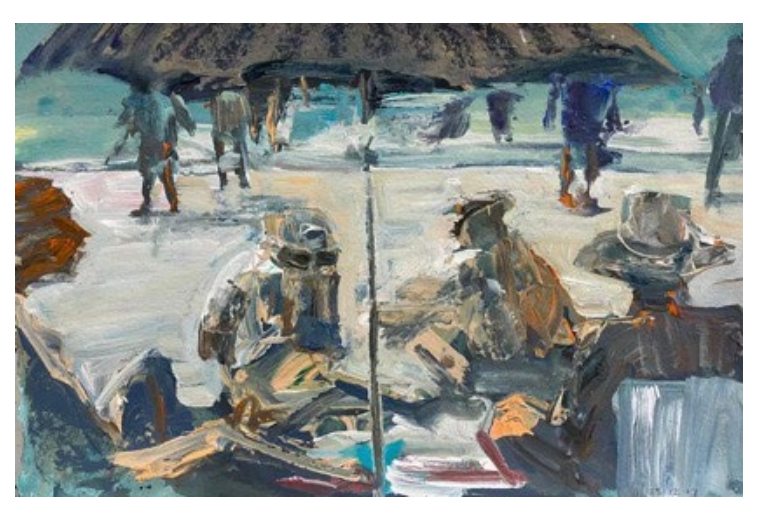
Family under umbrella, 2017 acrylic on paper, 38 x 58 cm