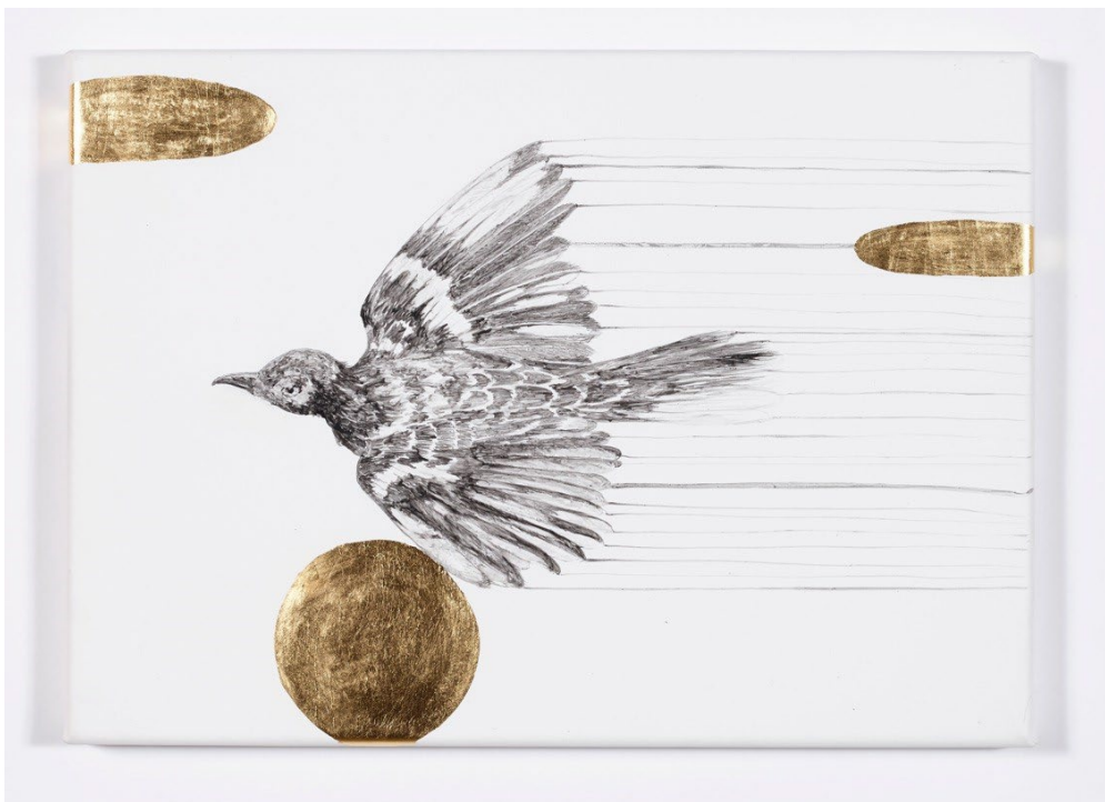
Janet Laurence Fabled 3 , 2011, altered camera trap image, archival ink on archival paper 60 x 48 cm

Caroline Rothwell combines a scientific focus with imagination to reflect on human activity and its effects. The image is an of endangered Australian species presented in a style reminiscent of science and natural history. Rothwell has drawn with the emissions found in the exhaust pipes of cars, mixed with a binder medium. She states "I thought it would be interesting to create a specimen drawing of an endangered creature using the pigment from our pollution". Her title names the endangered animal, the car model that provided the material, and other materials used.