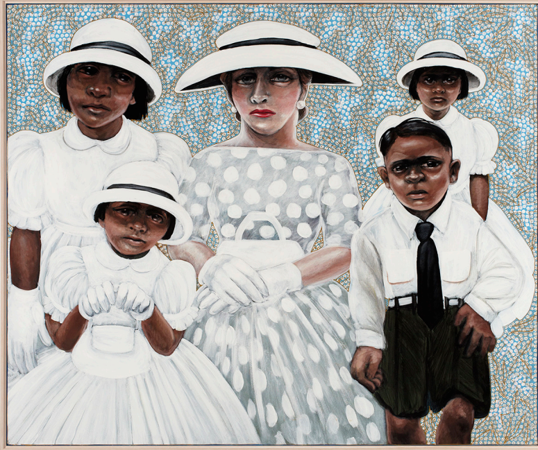
Image details: Julie Dowling, 'The Ungrateful,' 1999, Synthetic polymer paint, oil and gold on canvas. Artbank Collection

Recollections : brings together a selection of works by First Nations artists from the Artbank collection. With a focus on women artists, these artworks trace generational experiences across time and place, linking traditional and contemporary expressions of artistic practice.