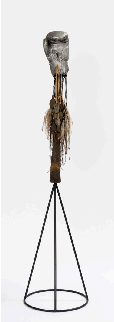
Karla Dickens Pound-for-pound #8, 2019 Aluminium, vintage mattock handle, waxed linen thread, cotton string, steel pulleys, emu feathers

Artbank is an Australian Government program that has directly supported living Australian artists for more than four decades of operation. Since opening in 1980 Artbank has grown to be one of the largest and most diverse collections of contemporary Australian art in the world.