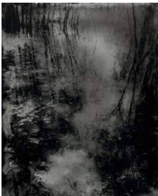
Justine Roche, Reflection Middle 2