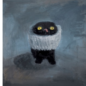
Oh , 2019 oil on board 40 x 40 cm