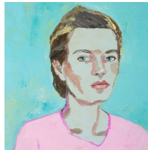
Self-portrait , 2018 acrylic and oil on board 52 x 52 cm