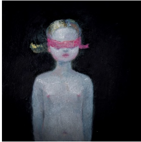
Blindfold , 2019 oil on hardboard 40 x 40 cm

Stockard's love of the peculiar, the comic and the ethereal can be seen in her paintings from memory of figures, portraits, landscapes and pets.