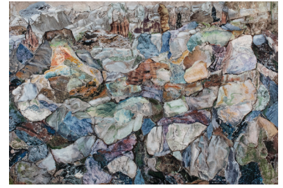
Rockface and Beyond