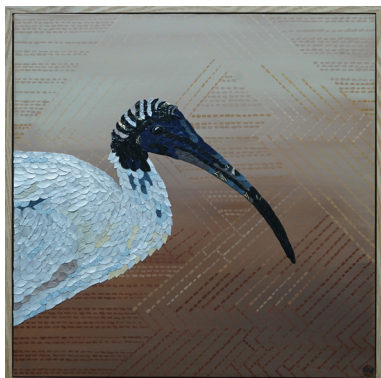
Daydream , 68 recycled coffee pods on framed canvas, 50 x 50 cm