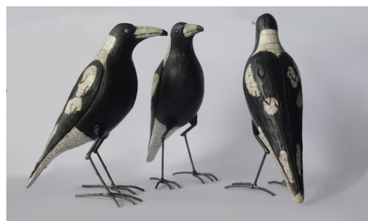
Magpies Charm , Ceramic, metal, epoxy, size variable