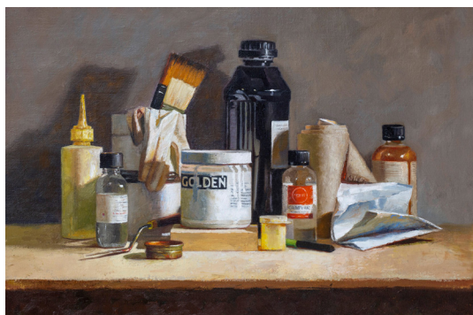
Artist Shelf , oil on linen, 35cm x 52.5cm