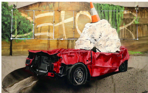
ROUTED/DETOUR , 2023, Altered traffic sign, steel A-frame, mixed media, aluminium plinth, 150 x 120 x 90cm