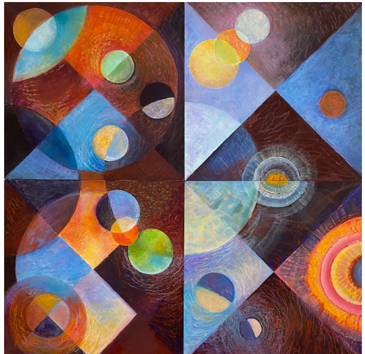
Supersymmetry 2024 acrylic and oil stick on board 61 x 61 cm