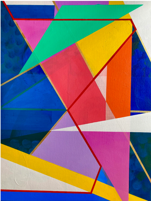
Untitled 2021 Oil on linen 40 x 50 cm